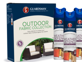
Outdoor Fabric Care Collection Kit.