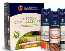
Outdoor Care Collection Kit