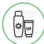
Sunscreen, Tanning Lotion