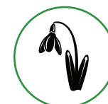
Flower & Leaf Tannin