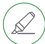
Pen, Ink, Marker