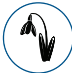
Flower & Leaf Tannin