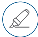
Pen, Ink, Marker