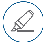
Pen, Ink, Marker