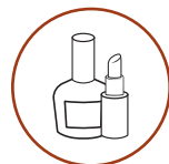
Nail Polish, Lipstick