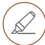
Pen, Ink, Marker