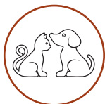
Pet Bodily Fluids