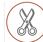
Rips, Tears, Cuts