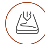
Deep Scratches, Gouges